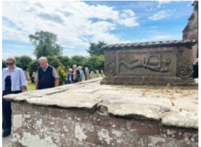
Exquisite wooden carvings and an interesting tomb at St Peter's church Plemstall.